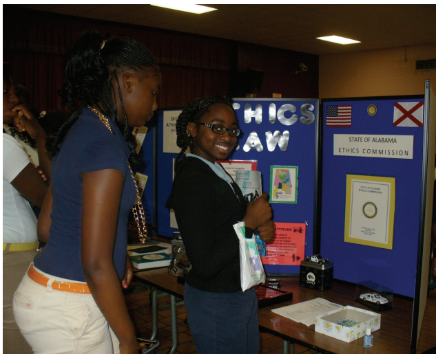
An aspiring attorney in-the-making looks over the information provided on careers in Law Enforcement.