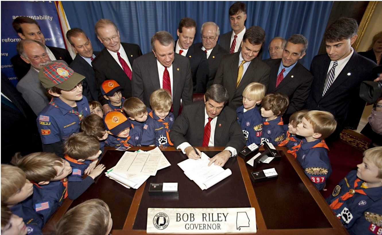
Governor Bob Riley signing the Ethics Reform package in a Signing Ceremony at the State Capitol on December 20, 2010. Surrounding Governor Riley are the legislative sponsors of the bills and a visiting troop of Cub Scouts from Birmingham.

For many years, the Ethics Commission and various legislative sponsors had offered and proposed both major and minor amendments to the Ethics Law, with little to show for our efforts. In December, 2010, Governor Bob Riley called the Legislature into Special Session for the sole purpose of enacting monumental ethics and campaign finance reforms. Included in this package were three bills amending the Ethics Law, including for the first time subpoena power for the Commission. The passage of this legislation on December 16, 2010 forever changed the role and scope of the Alabama Ethics Commission. At the signing ceremony, Commission Director Jim Sumner made the following statement: